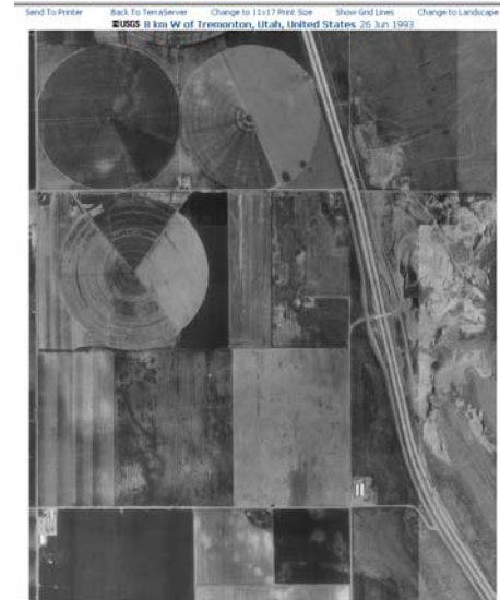
Example of MSN TerraServer with map, which uses USGS 1-meter ortho photos. Photo taken 6/26/03.

Google Earth Plus and Pro versions include drawing tools and allow you to download GPS points.